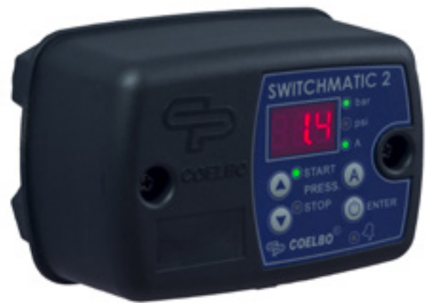
SWITCHMATIC 1 SWITCHMATIC 2 SWITCHMATIC 2/in-out